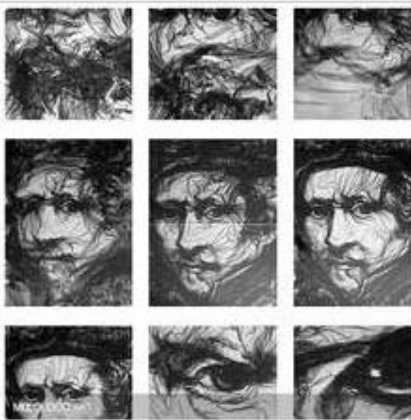
Benjamin Shine's Amazing Fabric Art